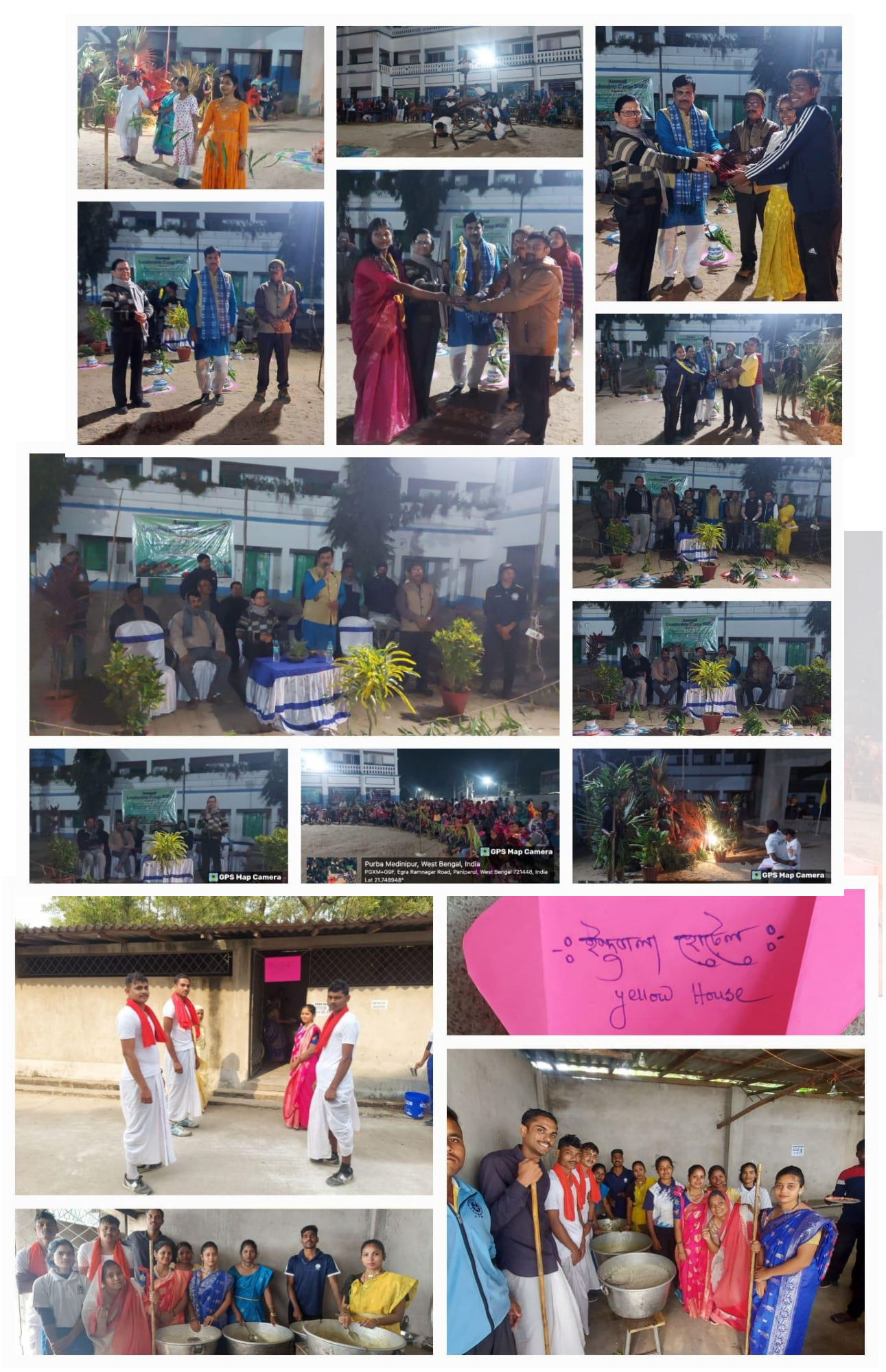
Camp fire program